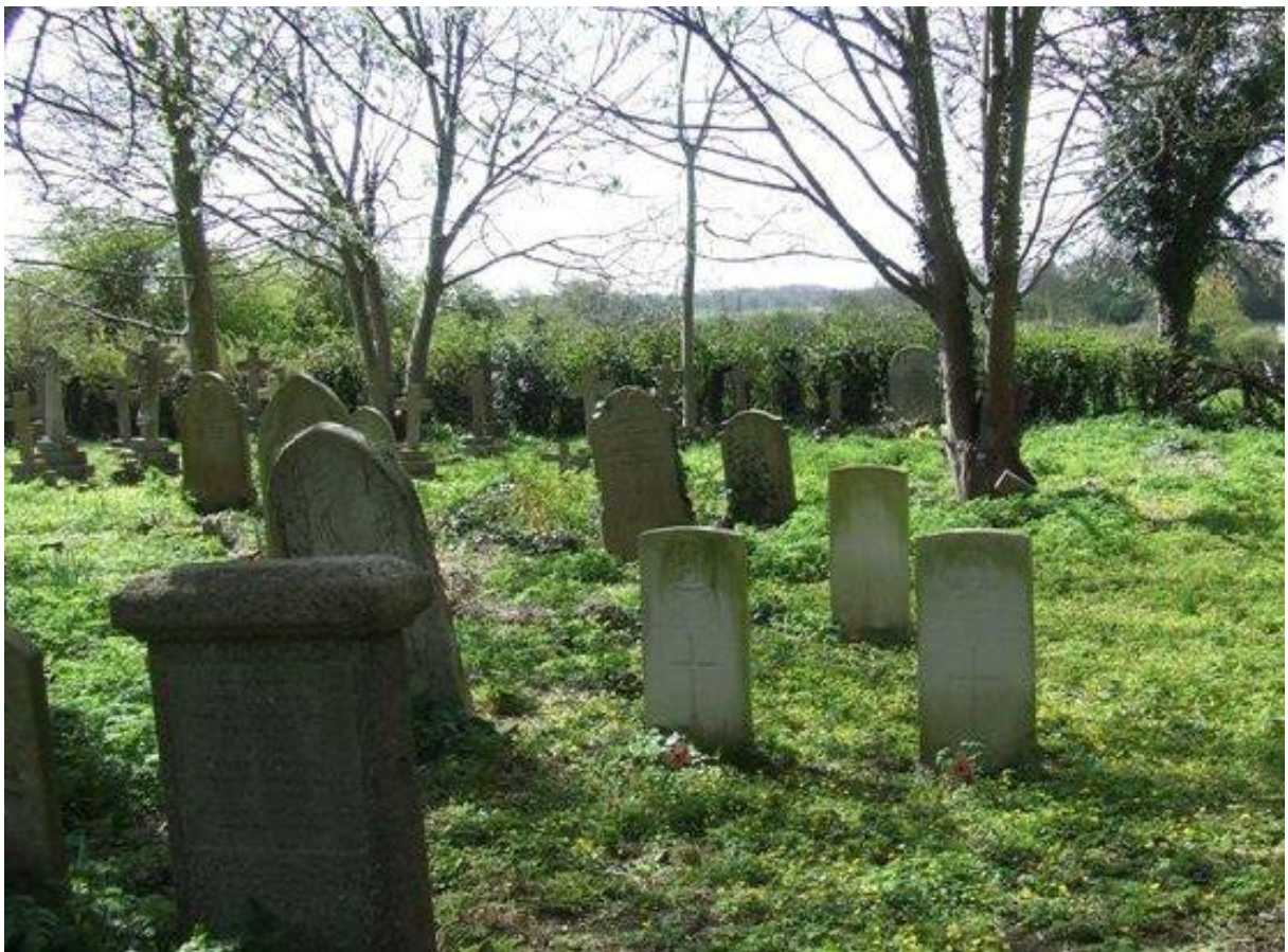
St. Mary & St. Hugh Churchyard, Harlow